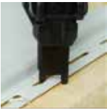
Vinyl siding tip available FSM40V